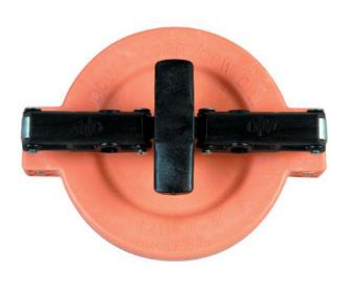
1711T Vapor Recovery Cap

The OPW 1711T Vapor Recovery Cap is for use with the OPW 1611AV, 61VSA, 1611AVB and the 1611VR Adaptors. The 1711T is installed on the vapor recovery adaptor, when not in use, to prevent vapors from escaping and to prevent water, dust and debris from entering the tank.