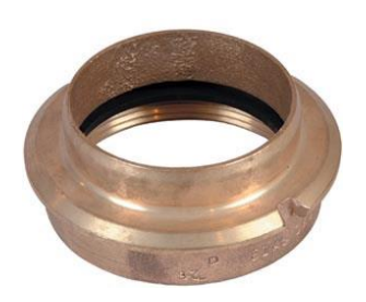
Tight-Fill Side-Seal Adaptor

OPW 61AS Side-Seal Adaptors thread onto the fill pipe of underground storage tanks, and are designed to mate with side-seal delivery elbows.