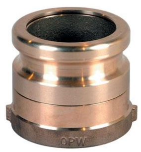
61SA Swivel Adaptor

The 61SA Swivel Adaptor mates with 4" topseal delivery elbows and features a top section that rotates with hose movement while the bottom section remains securely in place maintaining seal integrity.